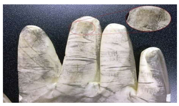
Fig. 7: Latex gloves treated with Cyanoacrylate method