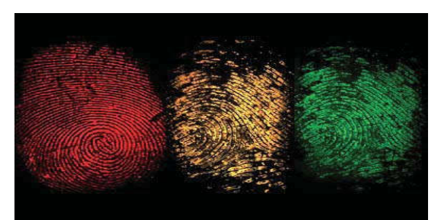
Fig. 5:Fluorescent powders of different colors