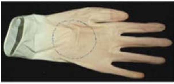
Fig. 6: Latex gloves treated with ninydrin method of chemical treatment