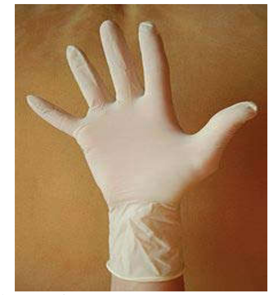
Fig. 3: Latex gloves