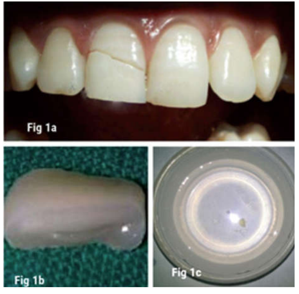
Fig. 1(a) Ellis class III # 11 Clinical picture, (b) Fractured fragment separated from tooth (c) Fractured segment stored in Normal Saline.

fractured fragment was attached to the crown but was grade II mobile. Radiographic examination revealed horizontal crown fracture of maxillary right central incisor with pulpal involvement (Fig. 2(a)). According to clinical and radiographic examination diagnosis of Ellis Class III fracture was confirmed, and treatment plan of reattachment of fractured segment using fiber post and dual cure resin was planned.