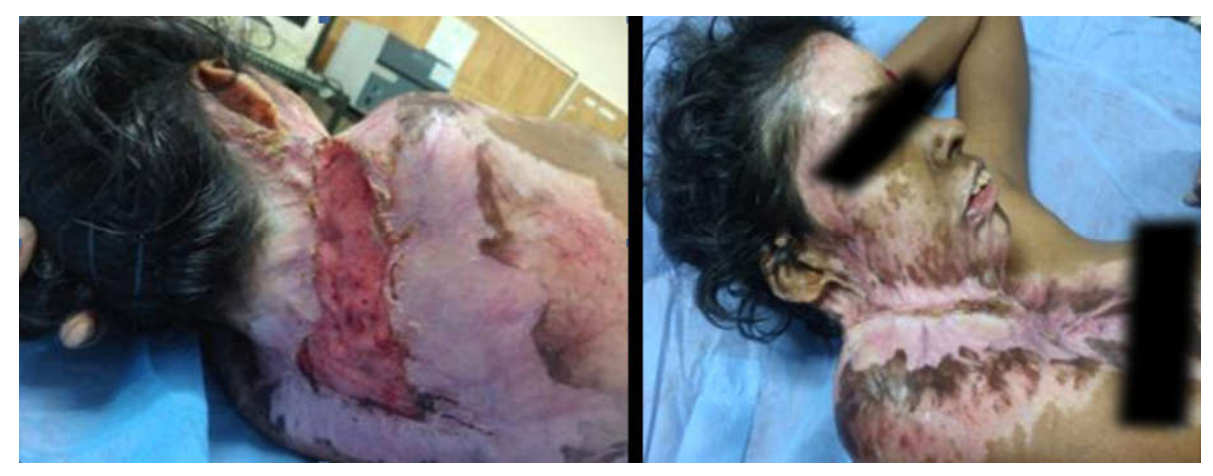
Fig. 1: At time of admission

This study was conducted in the Department of Plastic Surgery in a tertiary care institute. Informed consent was obtained from the patient under study. Department scientific committee approval was obtained. It is a single center, non-randomized, non-controlled study. The patient under study was a 27 year-old female, with no other known comorbidities presented with Post burn contracture in neck and right shoulder with Raw area at time of presentation (Fig. 1). She had restricted movement and difficulty in daily activities. X-ray of neck anteroposterior and lateral view done ruling out cervical vertebral disloction (Fig. 2). Antibiotic treatment based on culture sensitivity and she underwent Debridement with Split Thickness Skin Graft (STSG) (Fig. 3) and Autologous Platelet Rich Plasma Injection (APRP).Post Operative Day 4 Graft assessment done with APRP injection (Fig. 3). After