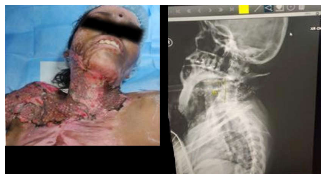
Fig. 6: Graft site assessment after 7 days and cervicomental angle 84 degree extension

3 weeks Post Burn contracture release and split thickness skin grafting (Fig. 4) with APRP injection. Graft take good, cervicomental angle improved to 84 degree at Postoperative day 7 (Fig. 6) and patient lost to follow up.