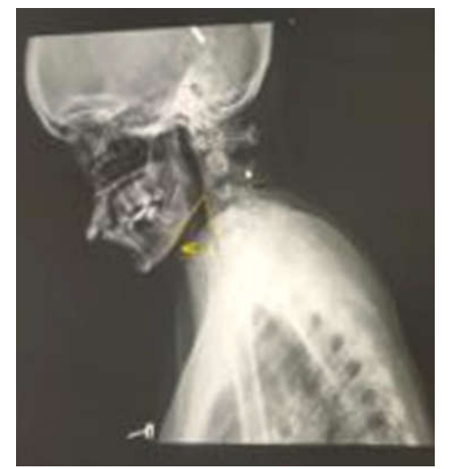
Fig. 2: Cervicomental angle 46 at the time of presentation