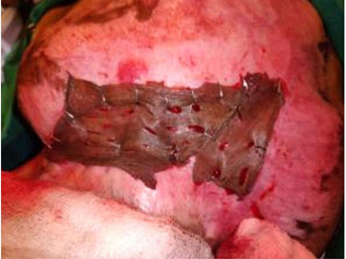
Fig. 3: Split Skin Grafting