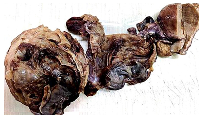
Fig. 1: Gross

Grossly, the mass was solid cystic arising from broad ligament; Total measurement: 15x 12x4 cm.