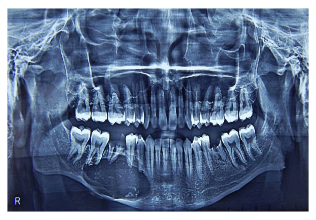
Fig. 2: A panoramic radiograph showing a well-corticated unilocular radiolucency with irregular radiopacity within it, in the periapical region of tooth #43(permanent mandibular right canine) to #47(permanent mandibular right second molar).

A panoramic radiograph revealed a well-defined, corticated, unilocular periapical radiolucency extending from the tooth #43 (permanent mandibular right canine) to #47 (permanent mandibular right second molar) with thinning the inferior border of mandible. Root pieces of teeth #36 (permanent mandibular left first molar) and #46 (permanent mandibular right first molar) were seen with apparent root resorption of the teeth #45 (permanent mandibular right second premolar) and #46 (permanent mandibular right first molar) (Fig. 2).