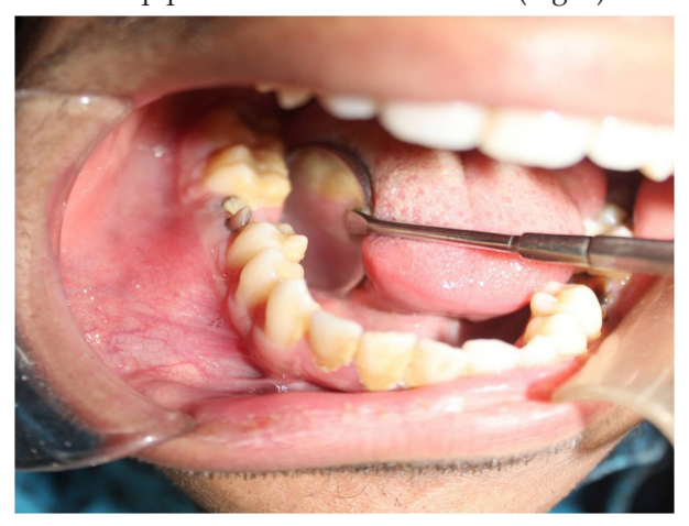
Fig. 1: Intra-oral swelling causing obliteration of right mandibular buccal vestibule.

(permanent mandibular right first molar) were evident. No cervical lymphadenopathy, draining sinus or lip paresthesia were observed (Fig. 1).