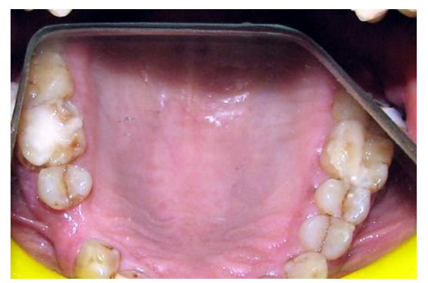
Fig 1: Occlusal View of Missing First Premolar

Contraindications [3] Bonding is contraindicated if there are