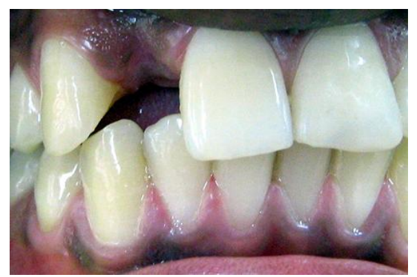
Fig 8: Missing maxillary right lateral incisor

Accordingly the prosthesis was completed and cemented with a resin cement. (Figure 7)