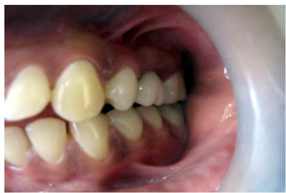
Volume 6 Number 2, April - June 2013

Fig 6: The planned design of the prosthesis