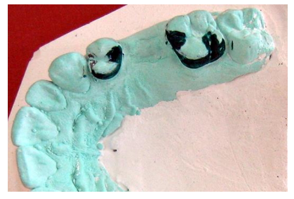
Fig 6: The planned design of the prosthesis

A 23 year old female patient reported with a missing tooth in the maxillary left posterior quadrant. A detailed history revealed the maxillary left second premolar was congenitally missing. The maxillary left first molar was extracted due to caries. Due to the congenitally missing second premolar the first molar had migrated to its place and after it was lost there was space for replacing only a single posterior tooth. (Figure 5)