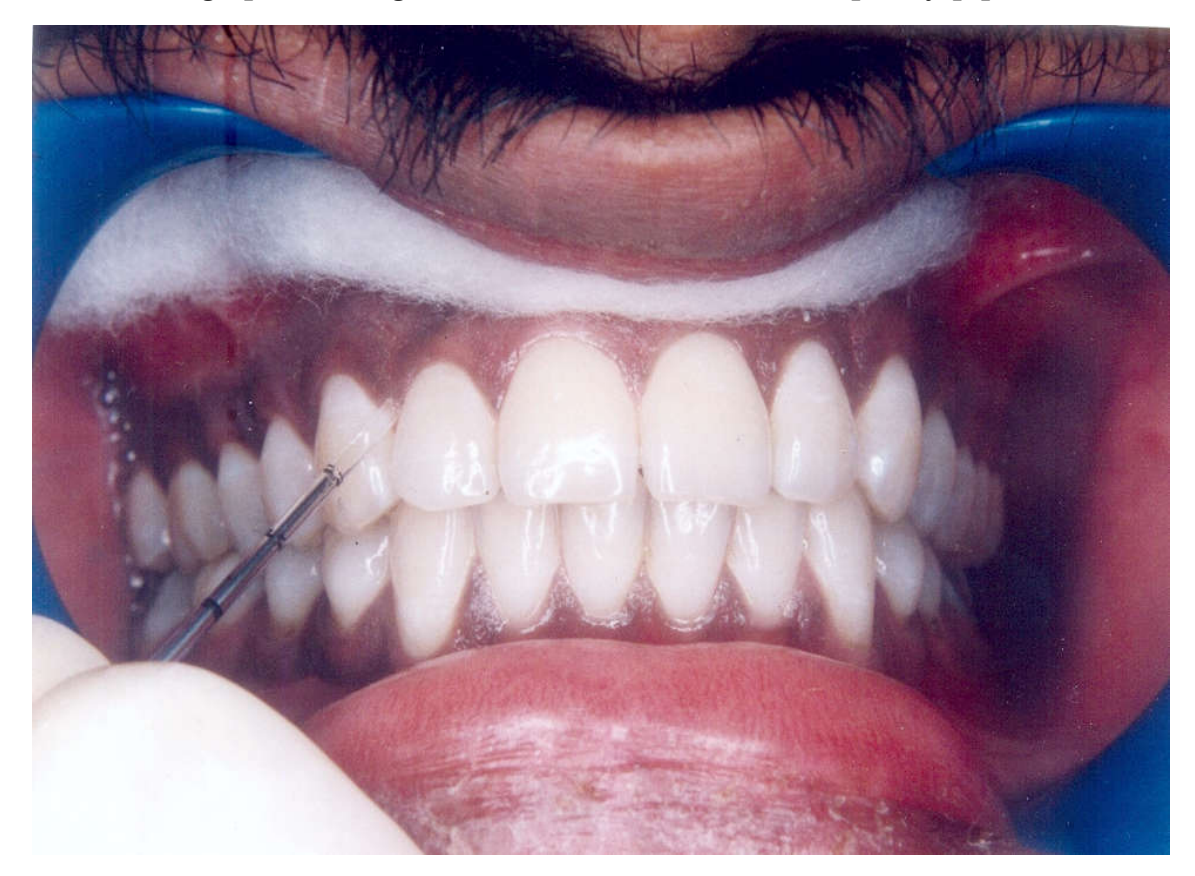
Photograph showing collection of GCF with microcapillary pipette