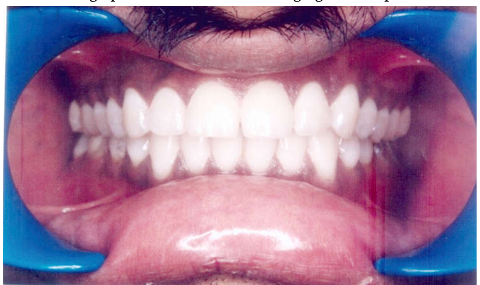
Photograph Of An Individual Belonging To Group I

8 out of 10 patients did not show any aminopeptidase level in the GCF collected