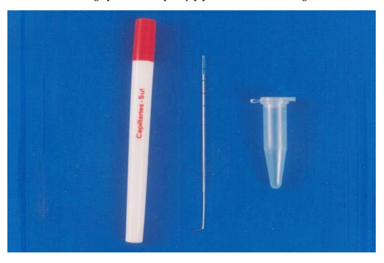
Photograph of microcapillary pipettes and microcentrifuge