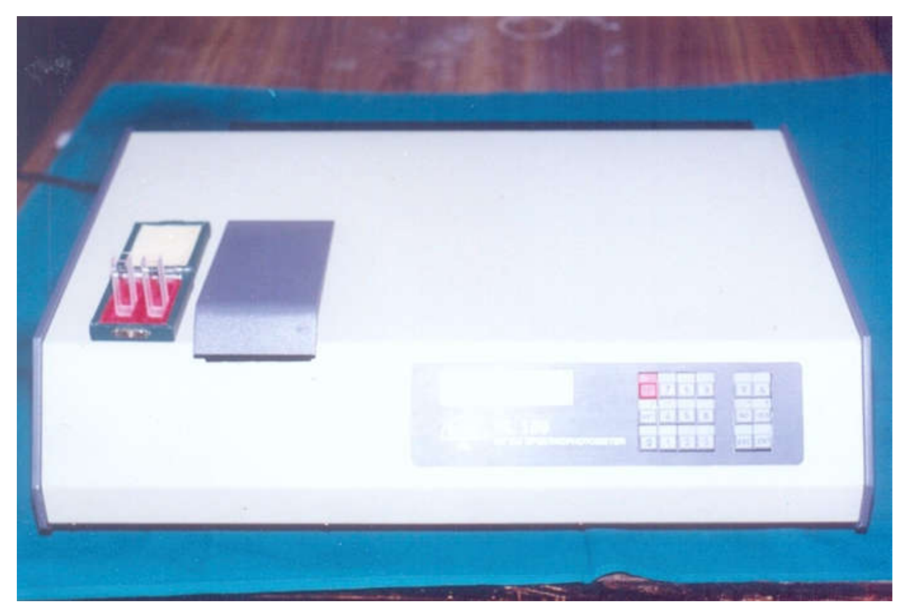
Volume 3 Number 1 January - March 2010