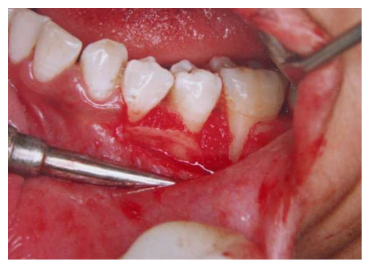
Fig 1b PerioGlas packed into periodontal osseous defect