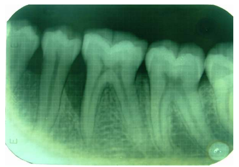
Fig 1c Preoperative radiograph demonstrates periodontal osseous defect on the mesial of mandibular first molar