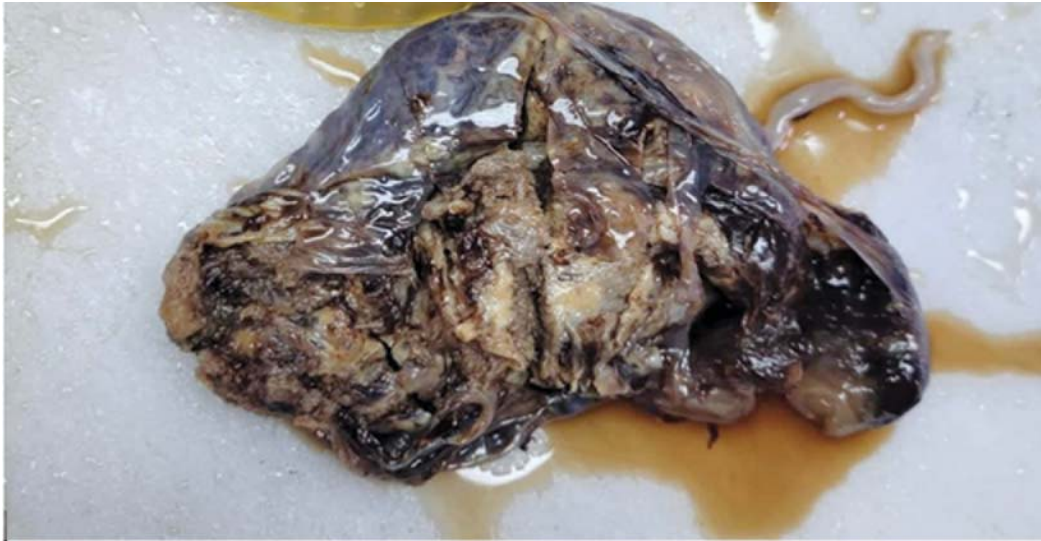
Fig. 1: Showing gross appearance of placental tumor.

She delivered baby girl of 385grams. Placenta was sent for histopathology. Gross examination of placenta was done, weighing 400 grams, 15*10*3 cms. Maternal and fetal surface are grossly unremarkable. A tumor, cystic in appearance of 3*3.4 cm noted. On microscopic examination placental chorioangioma with lakes of blood vessels seen.