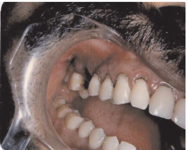
Fig 3: Buccal flap reflection