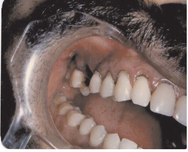
Fig 3: Buccal flap reflection