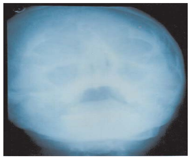
Fig 8: Post-operative radiograph

of root piece & foreign body in the sinus. P.A sinus view was taken for all patients. Diagnosis in all the cases were confirmed by passing a 26 gauge wire in the sinus through the oroantral fistula (or) communication and taking the x-ray.