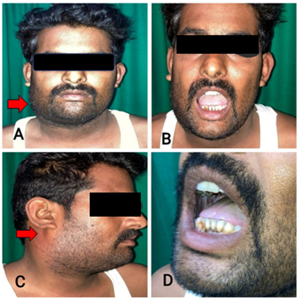
Fig. 1: Pre-operative image

On detailed clinical examination, a diffuse swelling measuring 3x5 cm was noticed at right lateral aspect of the neck in the upper cervical region pushing the lobule of the pinna superiorly and anteriorly (Fig. 1A, 1C). Skin over the swelling was warm to touch, tender, tense and reddish in colour (Fig. 1C). Patient's mouth opening was restricted to two fingers (Fig. 1B) and had a foul smelling breath and a poor oral hygiene. Teeth were stained because of chronic tobacco consumption