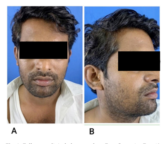
Fig. 4: Follow up clinical photograph on Post-Operative Day 40.

Regular dressings were done for a period of 28 days till the borders of the cavity naturally approximated following which secondary suturing was done. Raised blood sugar levels were managed by physicians throughout the hospital stay using fixed dose insulin and oral hypoglycemic agents. Patient was discharged on oral antibiotics on post operative day 29 and came for follow up on post operative day 40 showing drastic clinical and symptomatic improvement. (Fig. 4)