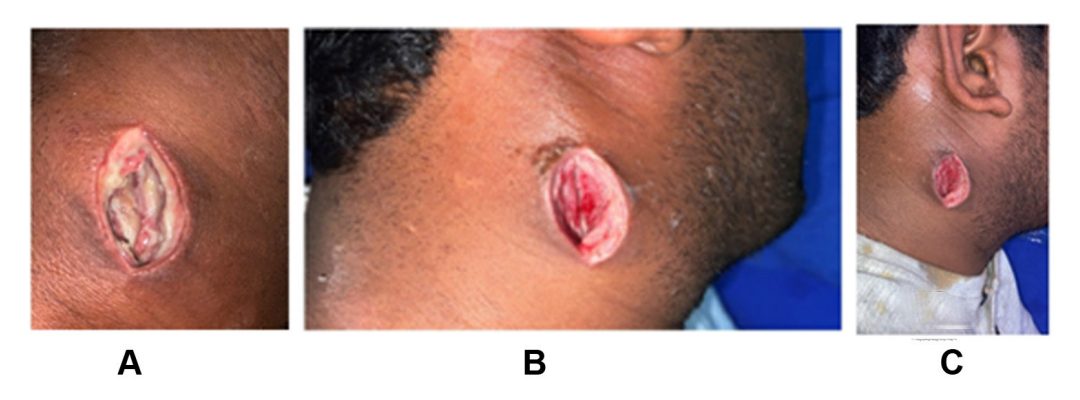
Fig. 3A: Wound image on post-operative Day 7. B: Wound image on Post-operative day 12. C: Wound image on Post-Operative Day 15.

Daily dressings of the cavity were done with mixture of Metronidazole Infusion IP (0.5%w/v) and Povidone Iodine Solution IP (10%w/v)wash and ribbon gauze soaked with Povidone Iodine Solution IP (10%w/v) was packed into the cavity. The edges of the cavity were digitally manipulated to drain out any residual pus. On post operative day 3 through microbiological reports we learnt that Gram staining of the pus showed plenty pus cells with Gram positive Bacilli and Gram negative Bacilli and Gram positive cocci.