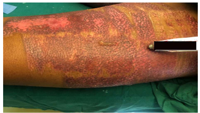
Fig. 2: Onion extract gel application

therapy (Fig. 3) as modalities for scar management. The Vancouver scar scale was used the grade the scar before treatment and after treatment. The scar scale before treatment was 7/13. After utilisation