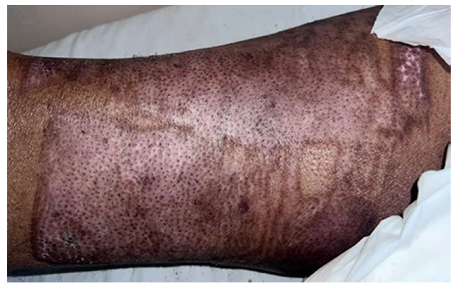
Fig. 4: Healed Scar at 3 months

The skin graft donor site healed well which was cosmetically good without formation of abnormal scar. (Fig. 4) The Vancouver scar scale after treatment for 3 months was found to be 4/13. Patient was compliance with all treatment strategies.