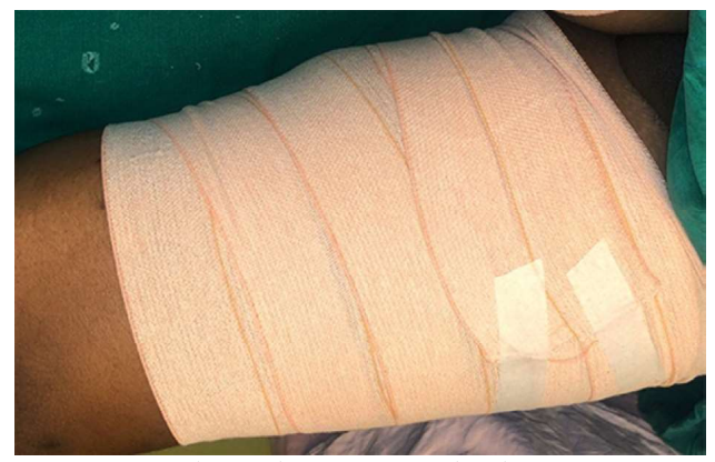
Fig. 3: Pressure therapy by compression bandage

therapy (Fig. 3) as modalities for scar management. The Vancouver scar scale was used the grade the scar before treatment and after treatment. The scar scale before treatment was 7/13. After utilisation