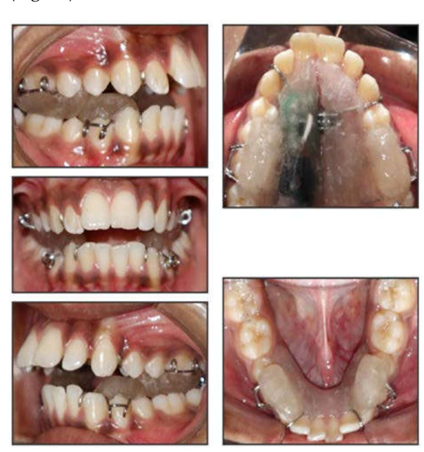
Fig. 3b: Patient wearing twin block appliance with electronic timing device embedded within acrylic of upper plate.

Informed consent of the parents was obtained for electronic assessment of wear time. Twin Block appliance was constructed with electronic timing device (sensor) embedded within the acrylic of upper plate to assess the wear time of appliance (Fig. 3b).