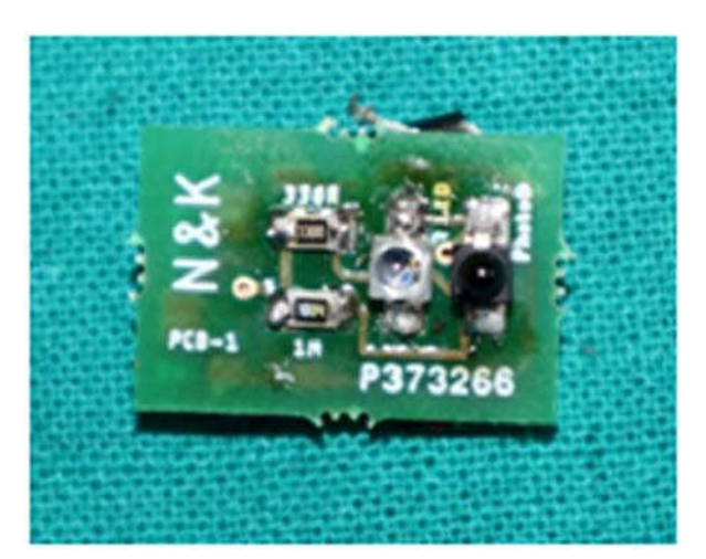
Fig. 1b: Assembled sensor

A minor modification on the working model is made by painting a non-reflective black paint on the palatal surface. The patient is instructed to keep the appliance on the modified working model