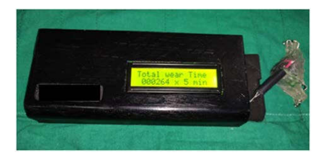
Fig. 2a: Receiver with displayed wear time

It is responsible for the detection and display of wear time data obtained from the sensor. It is a one time hardware and can read data from any sensor. The receiver is equipped with a LCD screen along with buzzer which gives an audio cue to the person extracting data from the sensing device. Receiver is also provided with replaceable batteries (Fig. 2a).