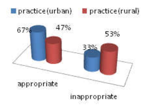
Figure 3: Distribution of the subjects by their practice.

According to the practice towards foot care, more number of subjects 20(66.66%) are from urban area had adequate practice towards foot care when compared to rural as revealed by table 3.