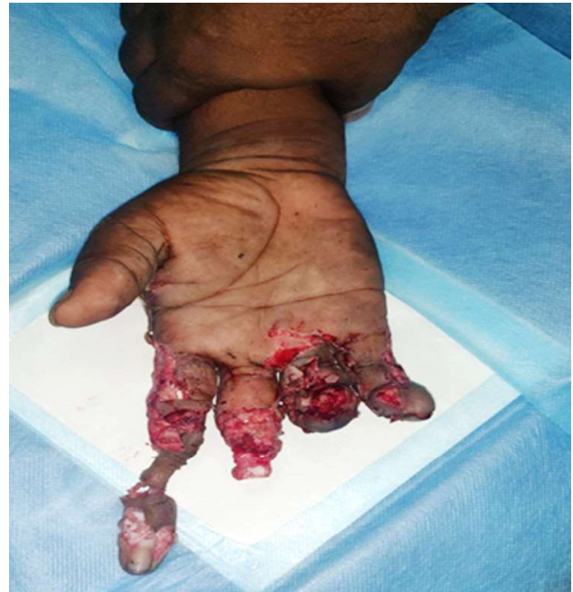
Fig. 4: Crush injury of the hand causing multiple amputations.

manageable at the facility of initial presentation.