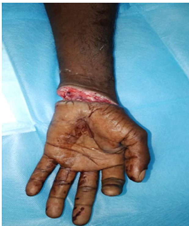
Fig. 3: Zone 4 Near total amputation.

replantation if the amputation occurs at the distal aspect of the middle phalanx or past the distal interphalangeal joint (DIP). Amputations at this level have historically had a bad prognosis due to the repair's inability to pass through the intricate digital pulley system. Amputations in Zone 2 are not absolute contraindications to replantation and should be considered in carefully selected individuals. 2