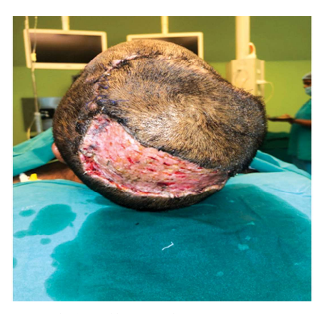
Fig. 2: Scalp electrical burn wound at presentation