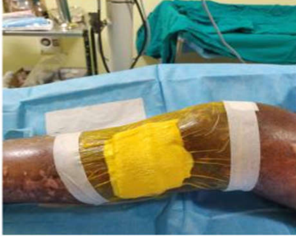
Fig. 7: Cyclic negative pressure wound therapy