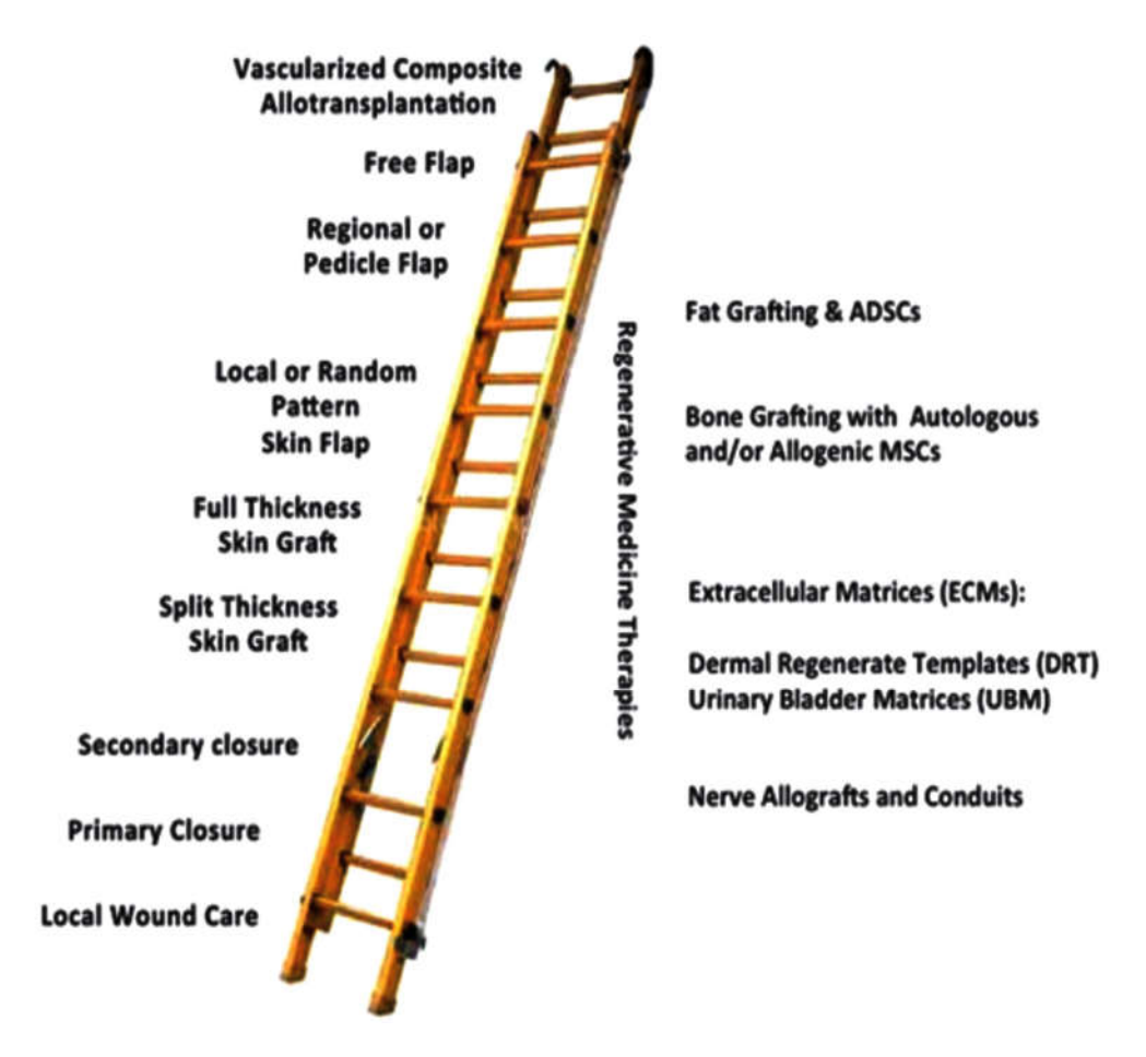
Source@ Article: Plastic Surgery Challenges in War Wounded II: Regenerative Medicine.

Consequently, this has led to increased use of regenerative medicine modalities to enhance tissue regeneration and improve reconstructive outcomes. Hence the term "Hybrid Reconstruction Ladder". (Fig. 5)