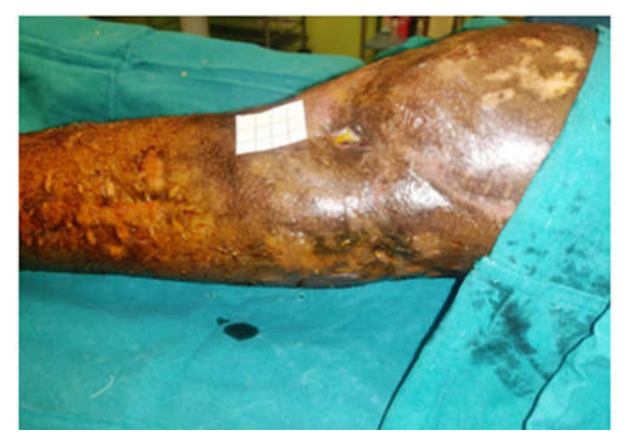
Fig. 8: Wound after hybrid reconstruction ladder

In our patient, the hybrid reconstructive ladder approach helped in a good wound bed preparation, helped to decrease the wound size, helped to decrease the duration of the hospital stay (Fig. 8).