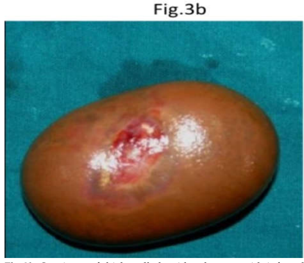
{\bf Fig~3b}; Specimen of thick walled uni locular cyst with infected fluid.