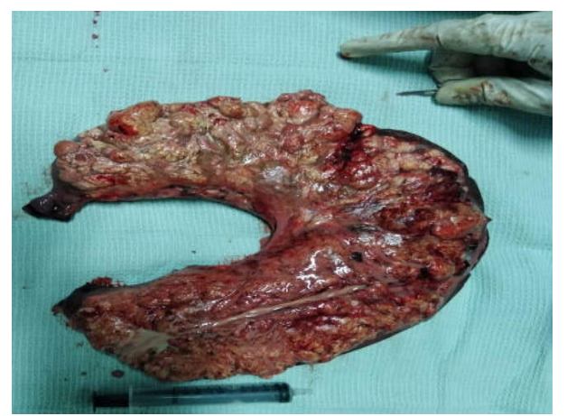
Fig 4: Excised specimen of large mesenteric cyst arising from transverse colon containing chylous fluid with macroscopic calcifications.