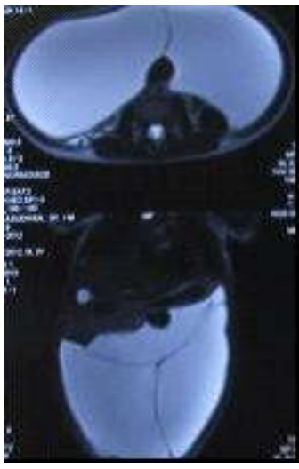
Fig 1 : MRI picture showing giant cystic lymphatic malformation occupying entire abdomen.