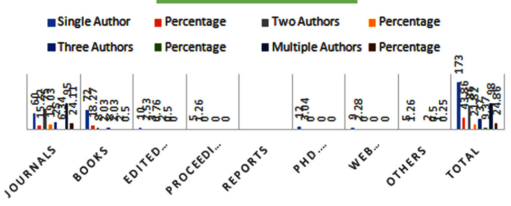
Fig. 2: Authorship Pattern

Authorship pattern is also shown more clearly in fig. 2.