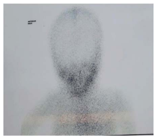
Fig. 1: Tc99 Sestamibi Scan,

The whole body x-ray revealed osteopenia. Tc99 sestamibi scan revealed no evidence of parathyroid adenoma or hyperplasia. Child was treated with saline diuresis, cinacalcet and zoledronic acid for 15 days. Calcium level fell to 20mg/dl beyond which there was no response. Child was planned for surgery after resuscitaton. Total parathyroidectomy + transcervical thymectomy + b/l carotid exploration was performed. All 4 parathyroid glands were excised and confirmed by frozen section. No ectopic or supernumerary parathyroids were found. Intra-operative parathormone monitoring is not available in our hospital. No intra operative complications were encountered. Post-operative period was uneventful. Child was started on calcium and calcitriol and discharged in good general condition. Genetic analysis showed homozygous loss of function mutation of CaSR gene mutation. Postoperative weight was 4 kg, S. calcium - 10.5 mg/dl, S. phosphate - 4.6mg/dl, S. parathormone - 20 pg/ml. Child is on continuous follow up.