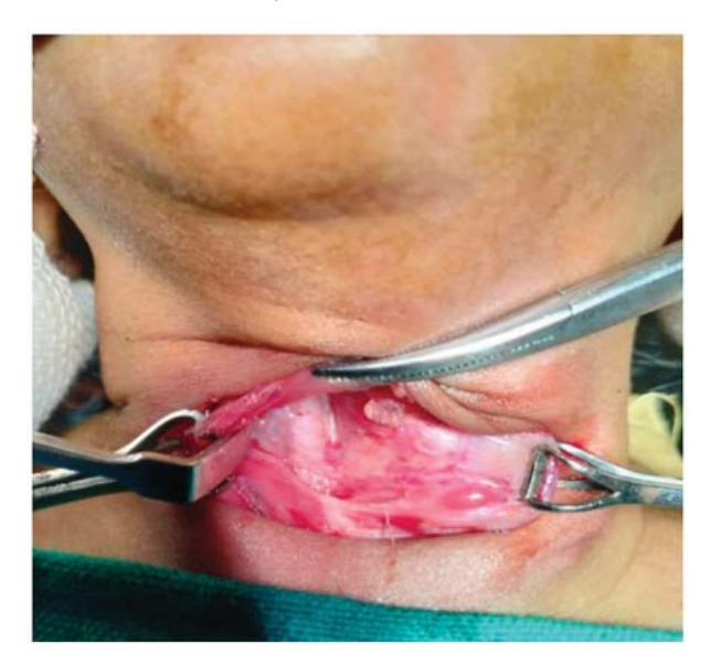
Fig. 3: Inferior Parathyroid