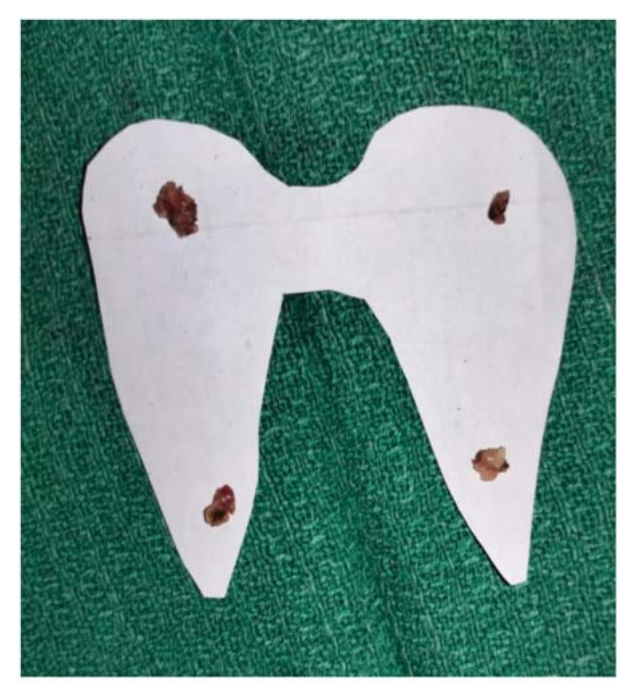
Fig. 4: Specimen