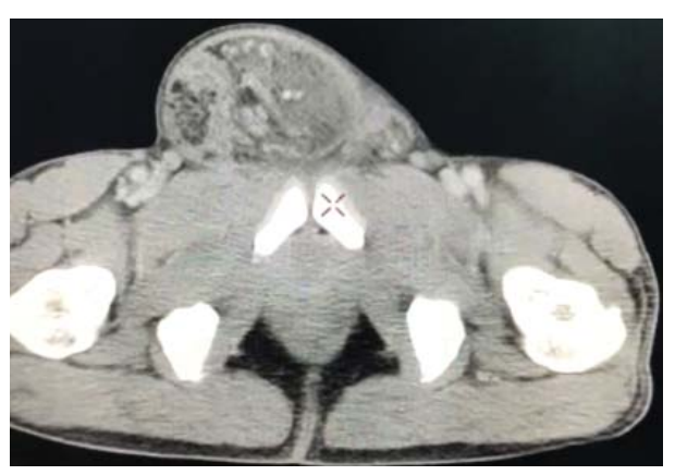
Fig. 3: Pre-operative picture of inflamed appendix and caecum